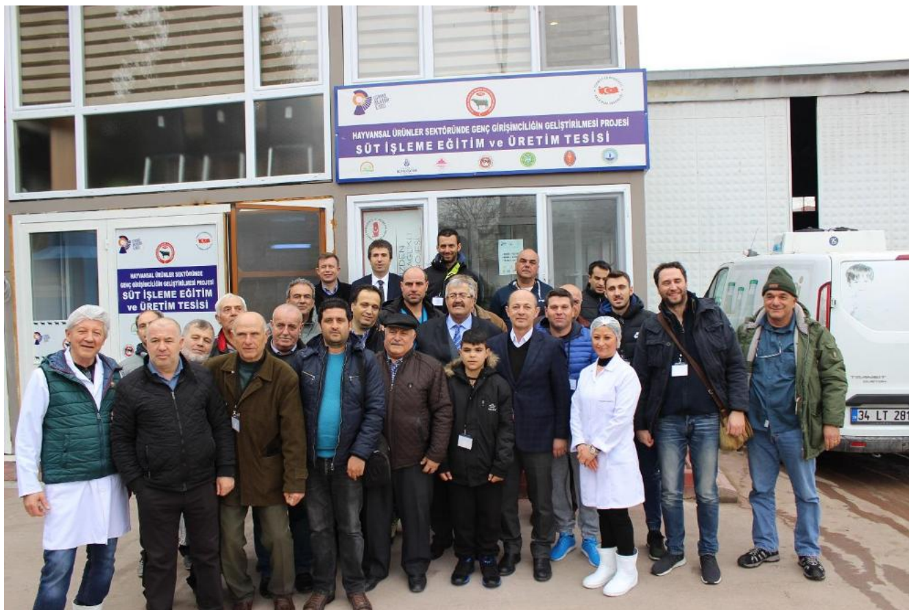
FIGURE 1. TRAINING VISIT OF THE GREEK BUFFALO BREEDERS IN TURKEY

The Greek Livestock Cooperative of Buffalo Breeders (GLCBB) in collaboration with the Center for Animal Genetic Resources of Thessaloniki and the Alexander Technological Educational Institute of Thessaloniki have joined their efforts in order to inform stakeholders about the benefits of buffalo farming and the importance of buffalo products.