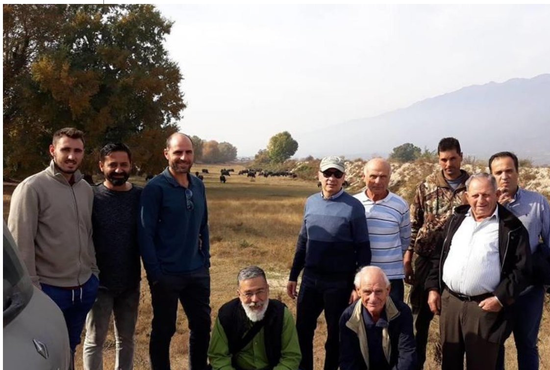
FIGURE 4. VISIT OF DR. TASSOS HANIOTIS, DIRECTOR OF THE DIRECTORATE FOR "ECONOMIC ANALYSIS, PERSPECTIVES AND EVALUATIONS; COMMUNICATION IN THE DIRECTORATE GENERAL FOR AGRICULTURE OF THE EUROPEAN COMMISSION