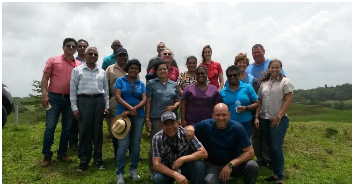
FIGURE 3 TRINIDAD & TOBAGO GROUP