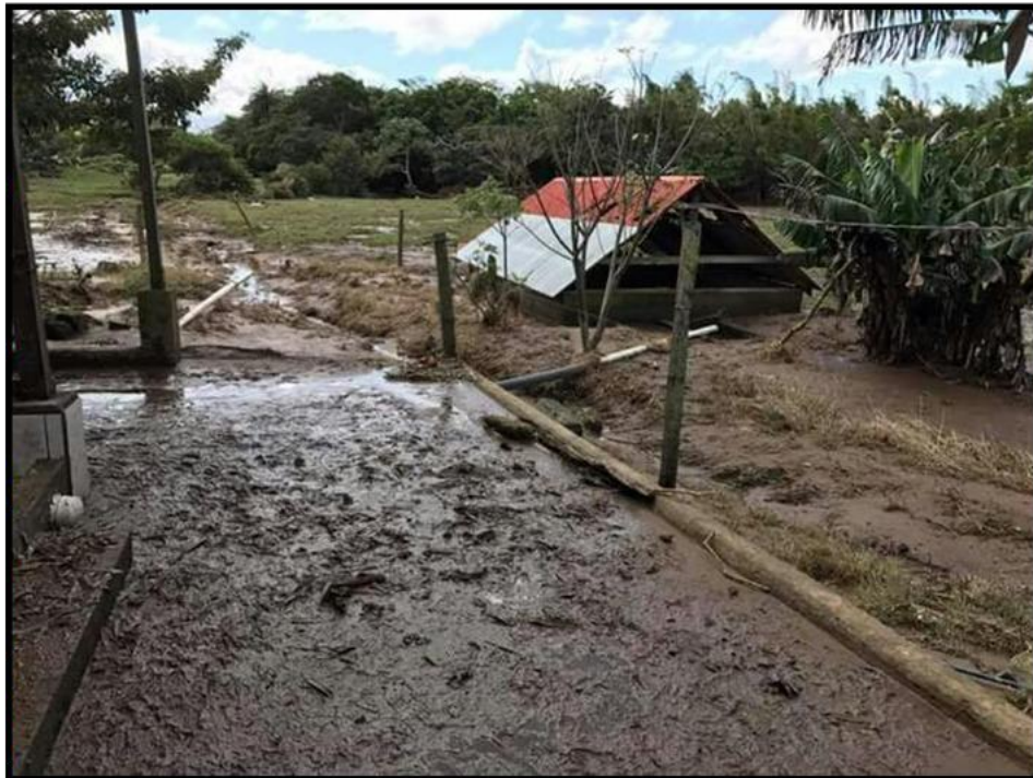
Dairy farm destroyed after the pass of the Hurricane Otto on November 26 th , 2016