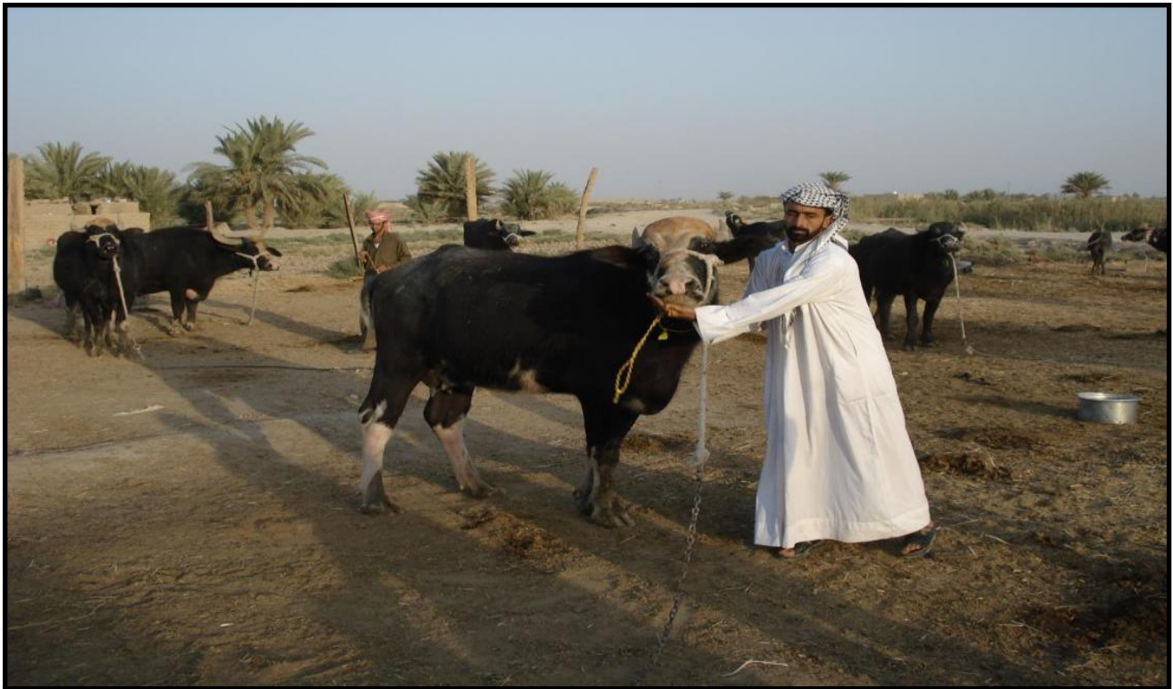
Photo 2. Iraqi buffalo fed on cottonseed-supplemented diet in Muthanna governorate