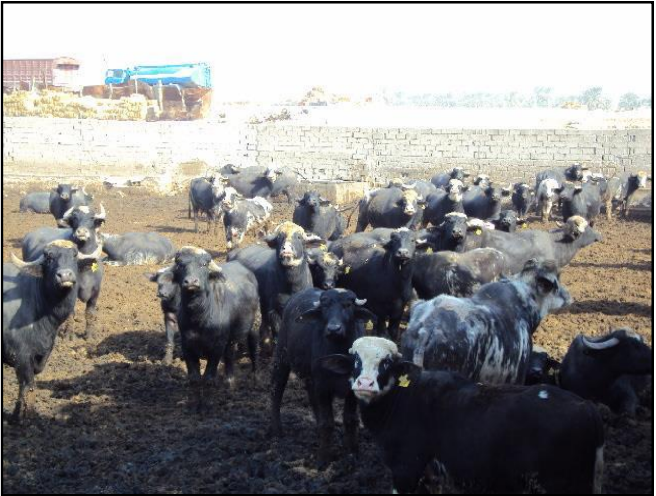
Photo 3. Iraqi buffalo fed on cottonseed-supplemented diet in Baghdad governorate