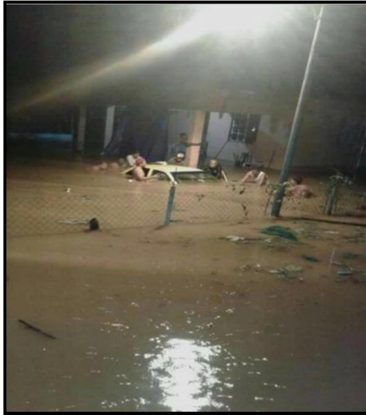
Community of Upala, Alajuela, Costa Rica after the pass of Hurricane Otto, early morning of November 25 th , 2016