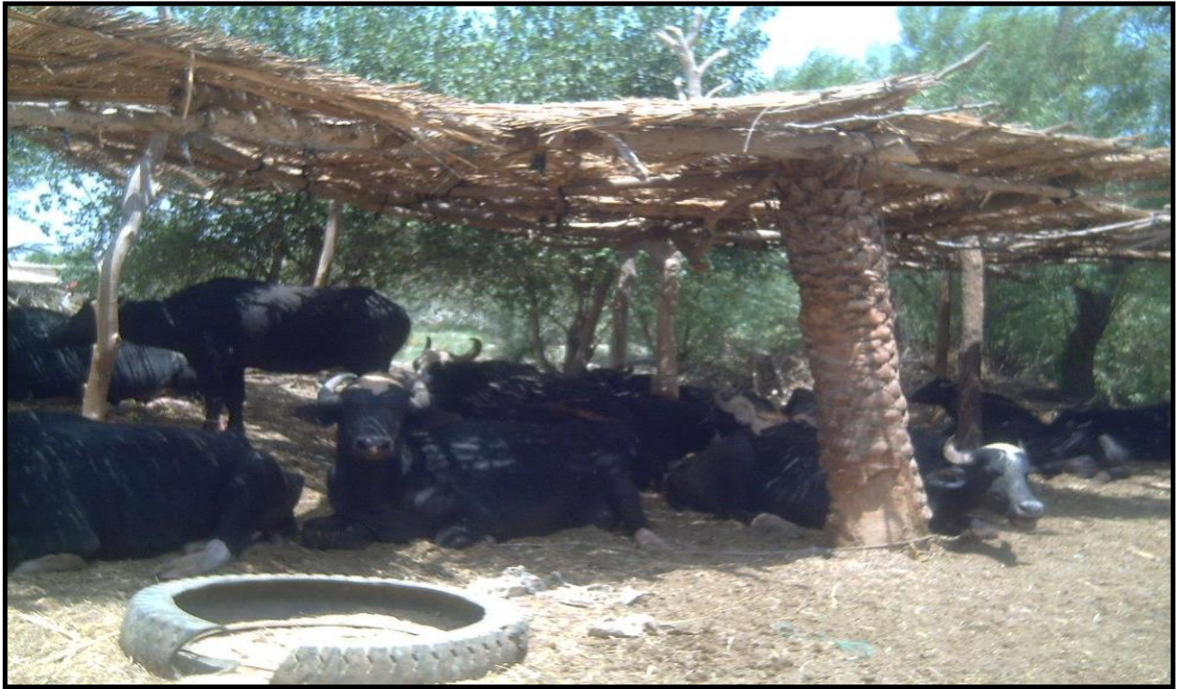
Photo 1. Iraqi buffalo fed on cottonseed-supplemented diet in Thi-Qar governorate