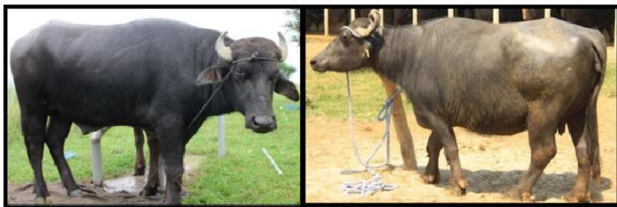
Fig.1.Indigenous Murrah type bull in Lal Teer R & D centre Fig.2.Indigenous Murrah type cow in Lal Teer R & D centre

Morphological characteristics: Cows are good sized and possess better milking ability. Males are bigger in size than female. The morphometric characters of Indigenous Murrah buffalo are as follows-