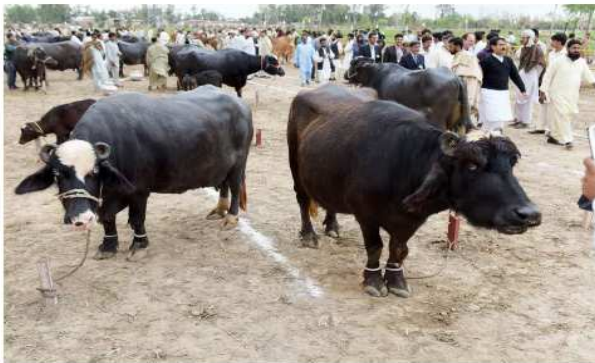
Buffaloes taking part in the Milk competition at Buffalo Research Institute, Pattoki