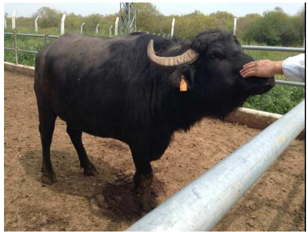
Figures 1 - 6. Saray Mandire farm, in Silivri district with milking rotary parlour.