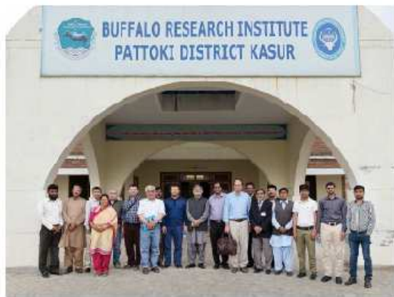
International Delegates from Turkey, Brazil, USA, and Nepal visited Milk Competition at Buffalo Research Institute, Pattoki