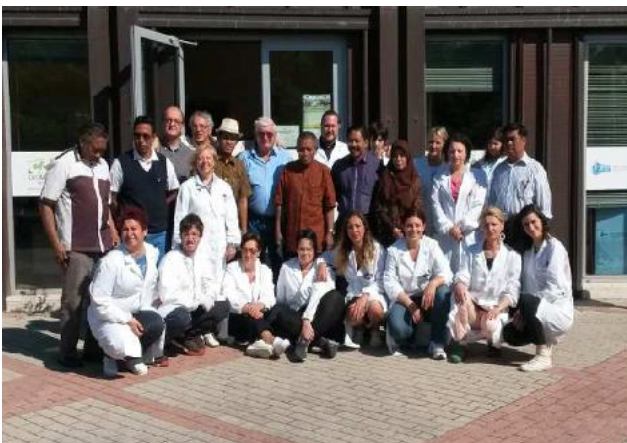
Indonesian and Italian people in Latina Section of Animal Prophylaxis Institute.