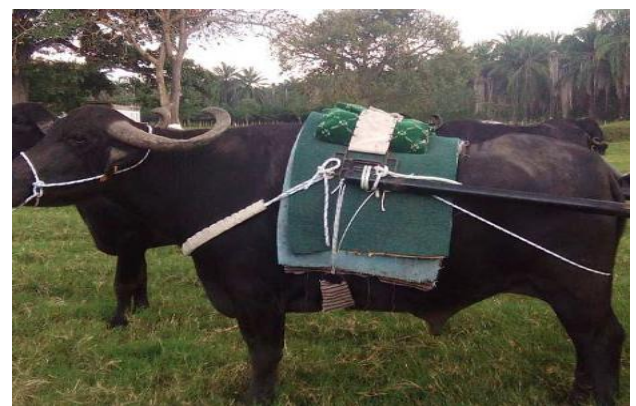
Figures 1 – 3. Symposium pictures