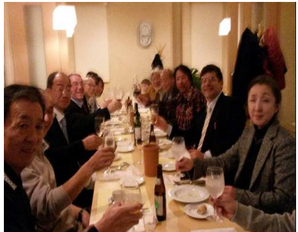
Visit in the Lake District Dairy Ranch and final dinner.