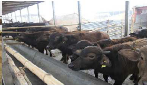
Fig 8. Calves group in Lal Teer R & D centre