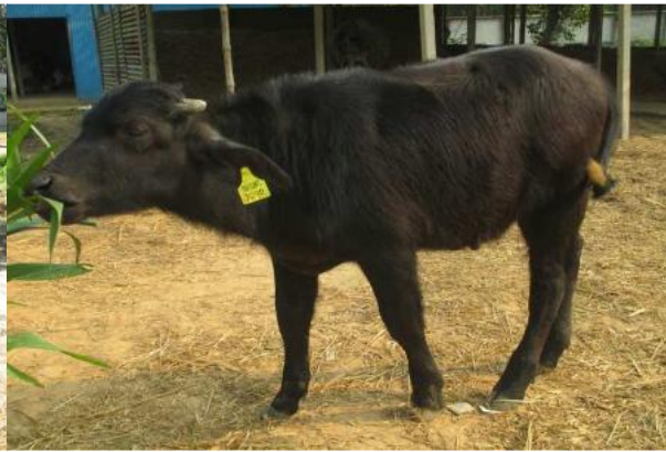
Fig.5. F1 Bull in Lal Teer R & D centre Fig.6. F1 Female calf in Lal Teer R & D centre