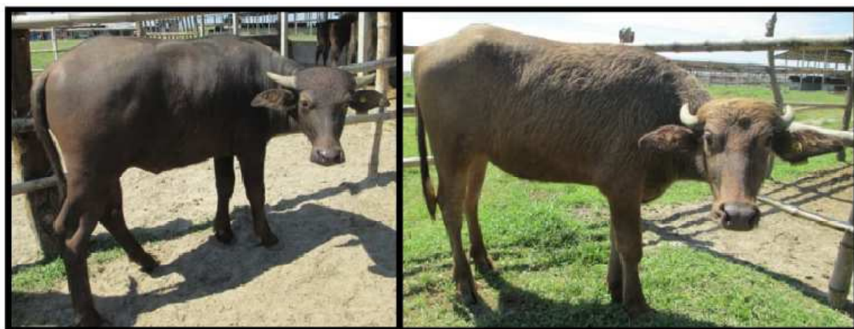
Fig.9. Local Male in Lal Teer R & D centre Fig.10. Local Female in Lal Teer R & D centre