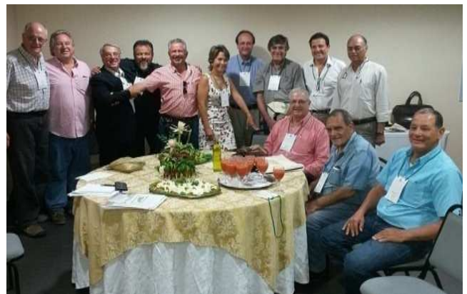
IBF informal meeting in Manaus