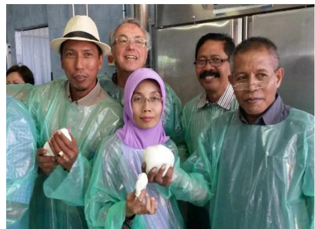
Visit in Perseo Cheese Industry.