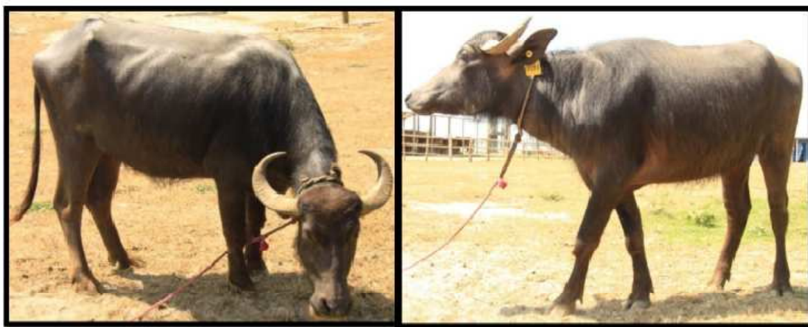
Fig.3. Indigenous plain land riverine type buffalo in Lal Teer R & D centre

Purpose of breed: Dual type; males are used for meat purpose and females for dairy.