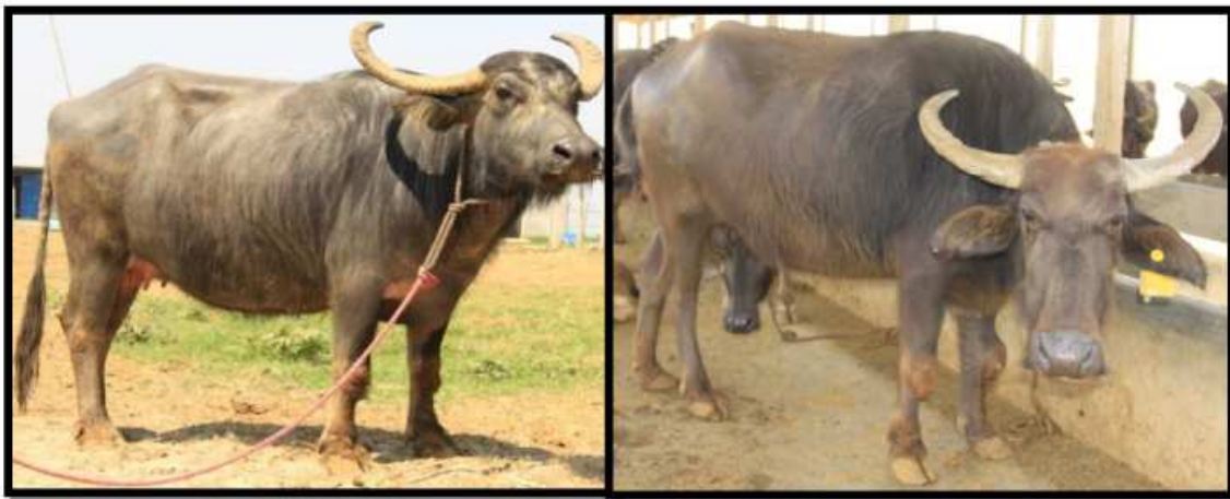
Fig.4. Wild type arni in Lal Teer R & D center

Purpose of breed: Mostly meat and partially harvest milk.