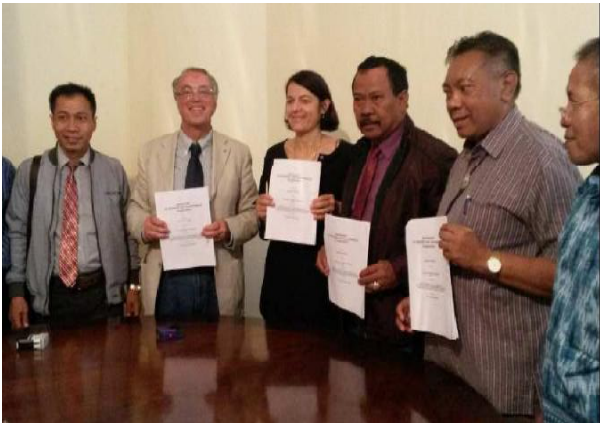
Agreement signature in the Chiacchierini bull Centre.