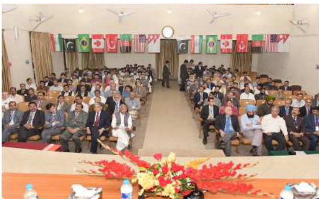
Participants of the Symposium during the inaugural session