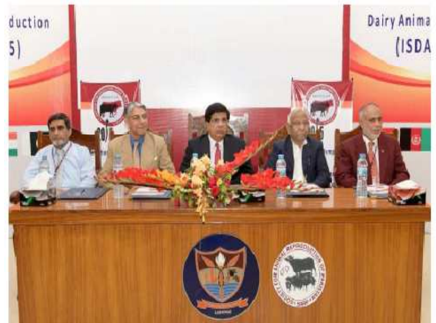
Concluding session of the Symposium