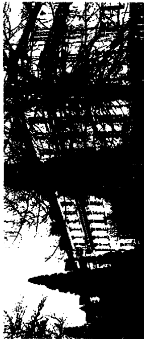
Institute of Biology and Immunology of Reproduction

Sunday, October 8, 1995 9:00 am Trip to Buffalo Farm (The time of return will be considered with those wishing earlier depart).