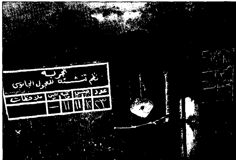
Figure 1 (top) and 2 (bottom) show the calf hutches and the indoor pens (traditional) used in the experiment and their spacing.