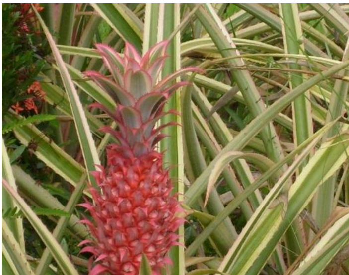
Pineapple in Corsicana Farm