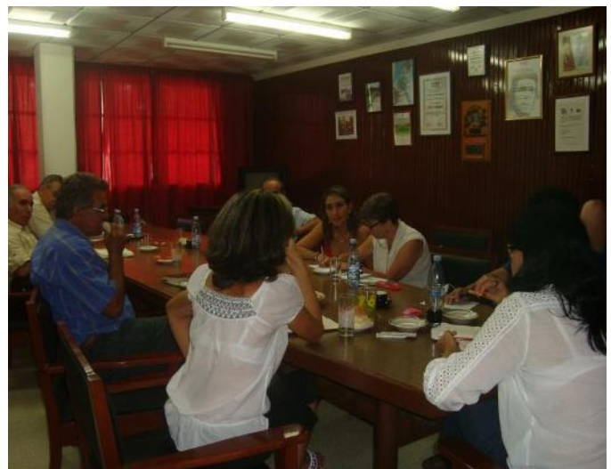
Meeting at the ICA (Instituto de Ciencia Animal)