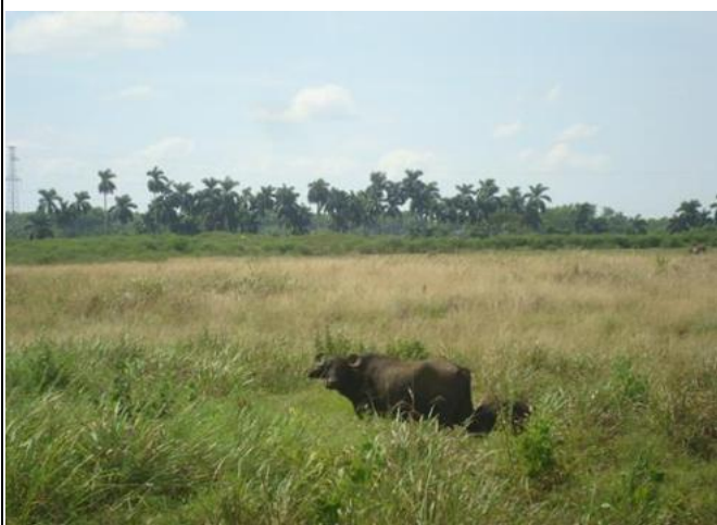
Cuban Buffaloes in the typical tropical landscape