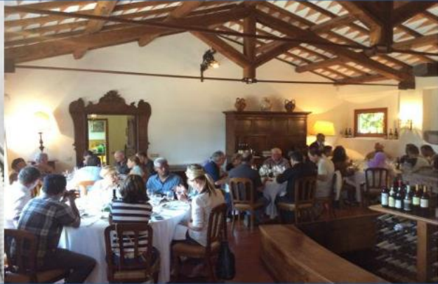
Dinner in Casale del Giglio Wine Farm