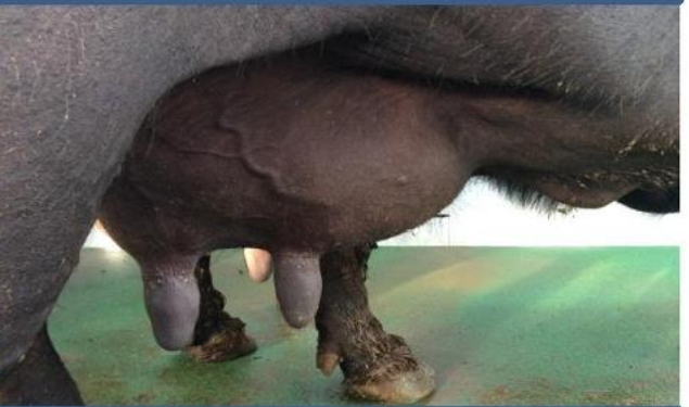
Good udder conformation