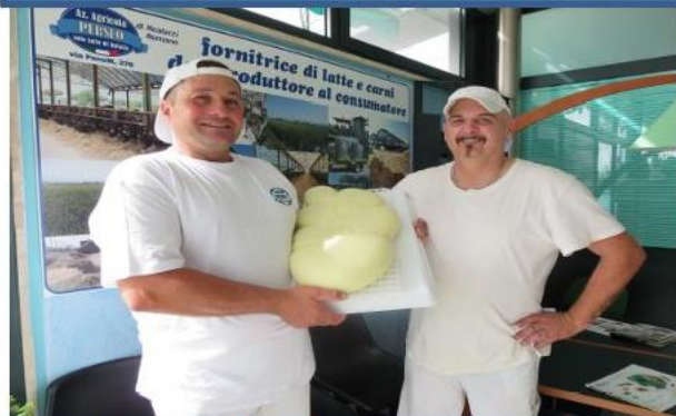
The big "treccia" of buffalo mozzarella