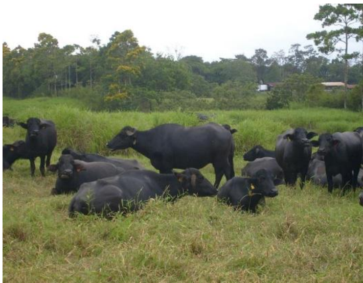
Mediterranean ItalianxMurrahxBuffalypso in Mendoza Farm