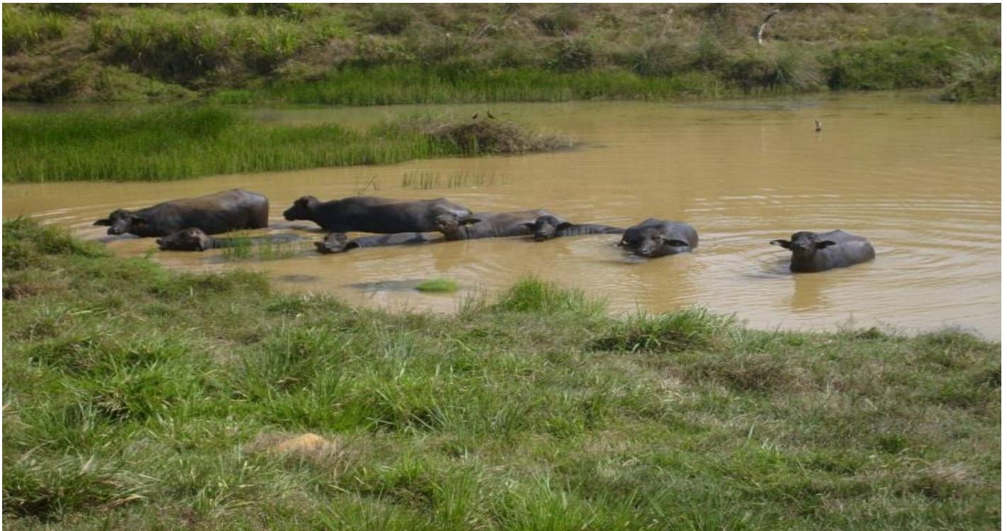
Murrah x Buffalypso in Puchino Farm