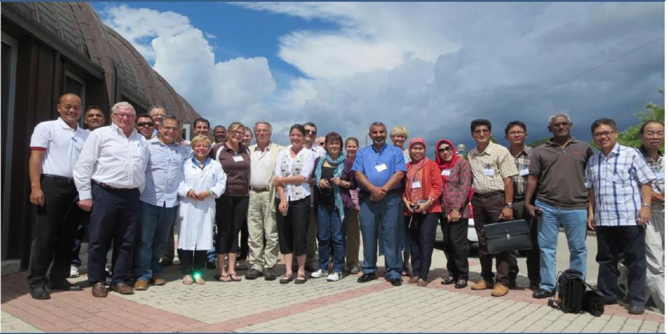
Animal Prophylaxis Research Institute, Latina, Italy – Teachers and Participants