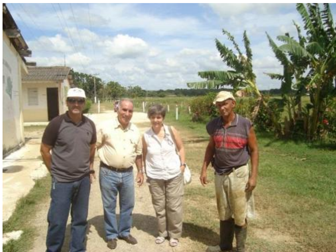
Visit at the ICA (Instituto de Ciencia Animal)