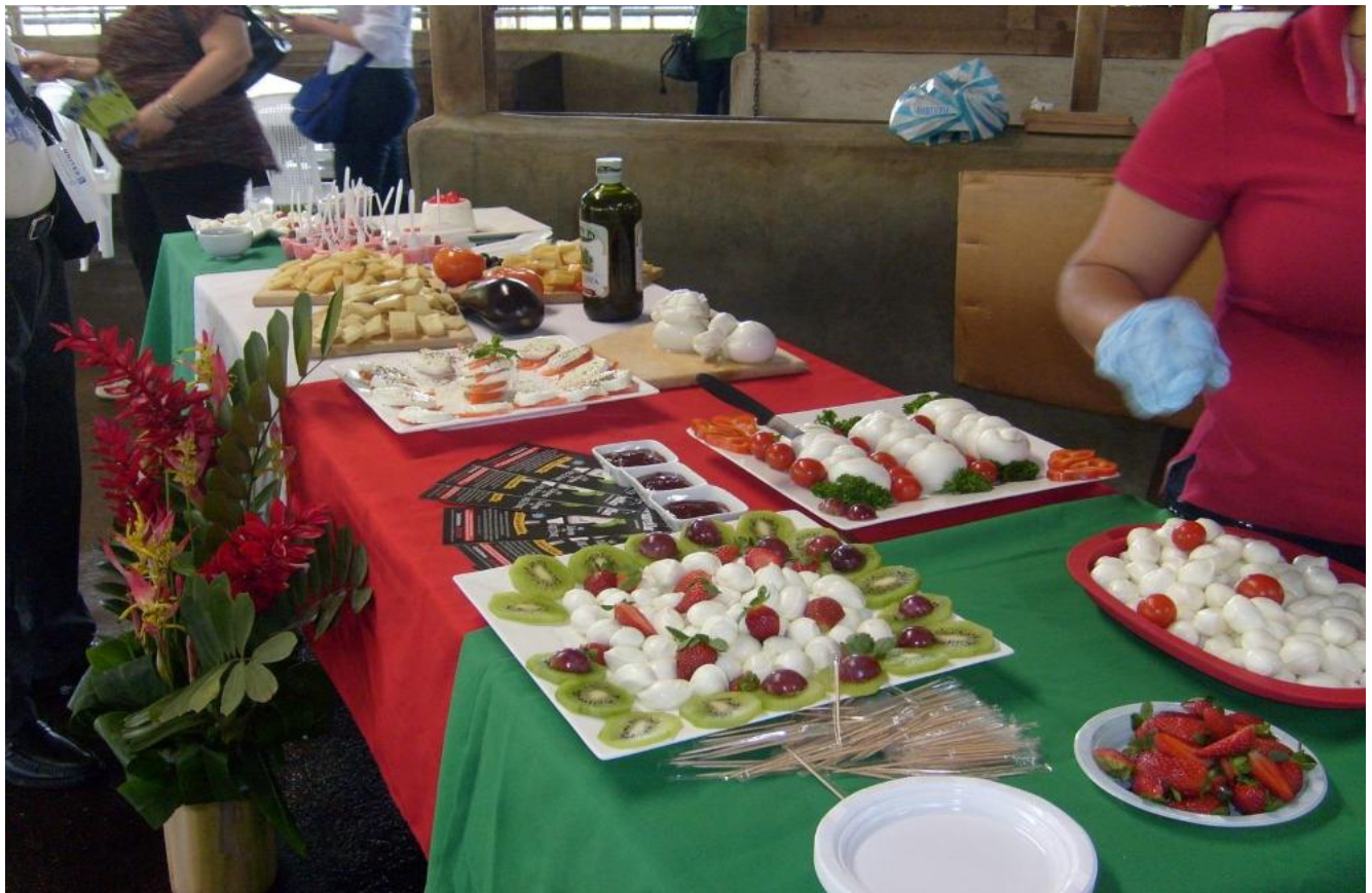
Products by Italacteos offered in Puchino Farm