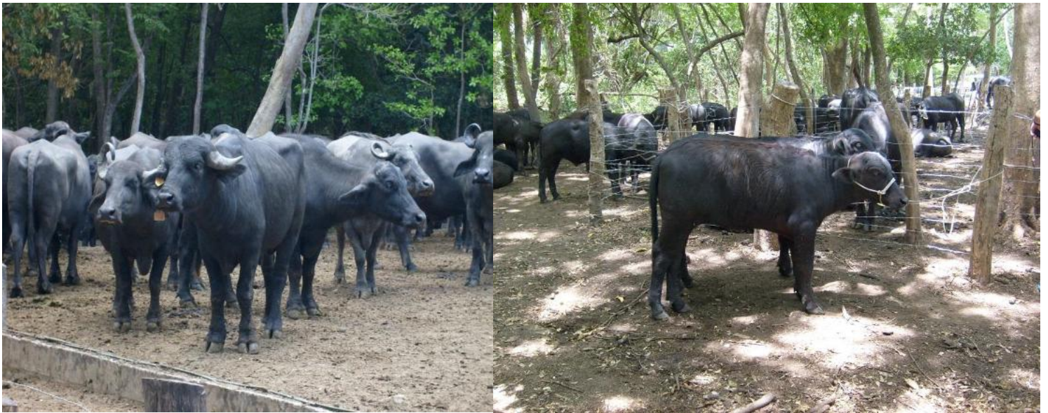
Mediterranean Italian x Buffalypso in Bolson Farm