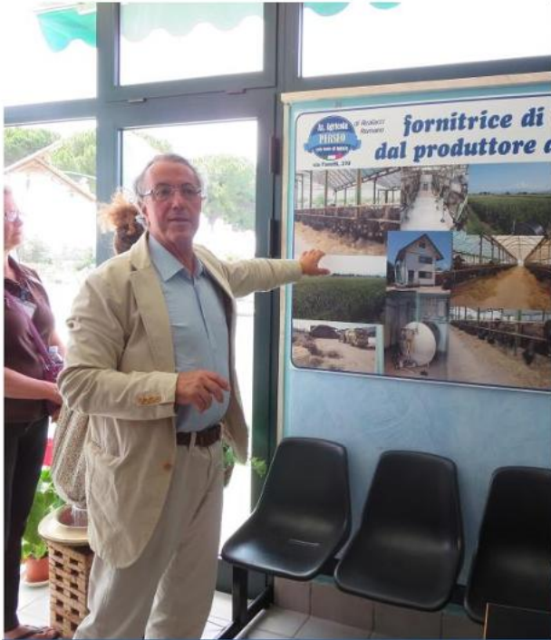
Presentation of Perseo Cheese Industry