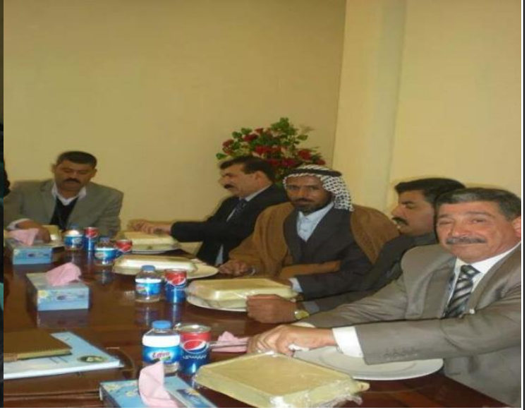
Breeders and researchers at lunch time.