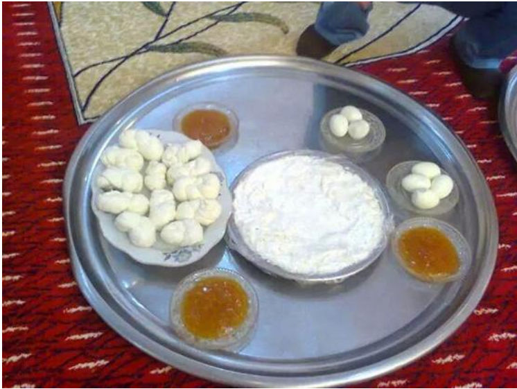
Gaymer, thick whitish cream at center surrounding by Maddfore buffalo cheese and eggs with jam,famous iraqi Breakfast