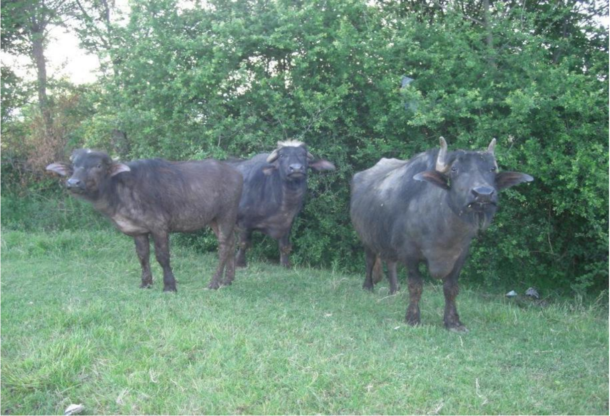
Figure 2. Buffalo small herd in pasture.