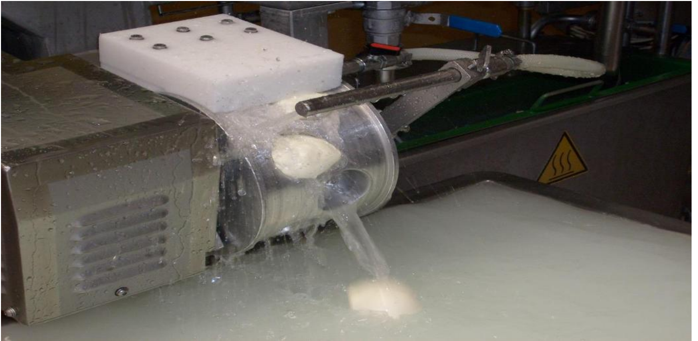
Mozzarella cheese produced by Italacteos Company