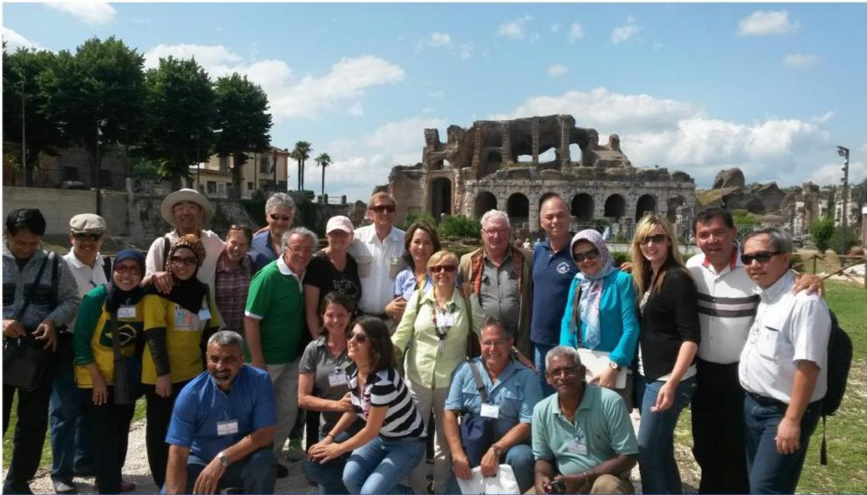
The group at the Roman Amphitheatre in Capua, Italy