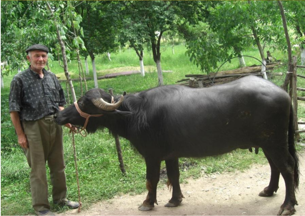
Figure 1. Buffalo type in Kosovo.