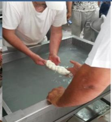
Moulding of "treccia"