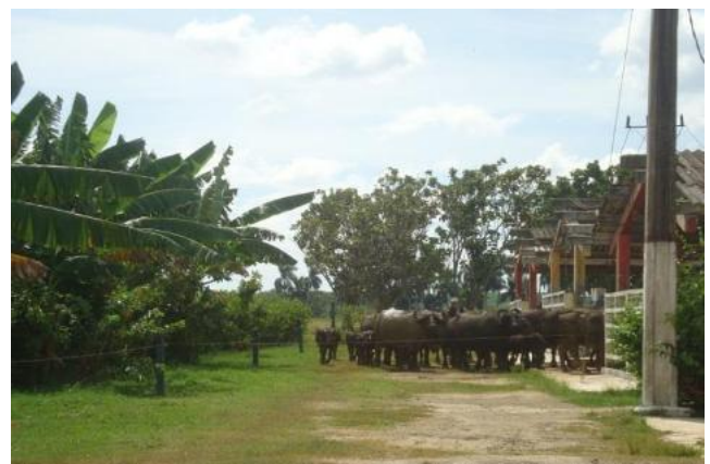
Cuban buffaloes at the ICA dairy farm