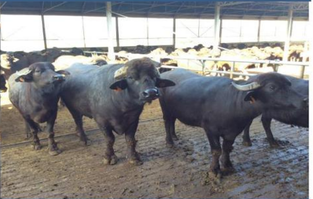
The bull with buffalo cows