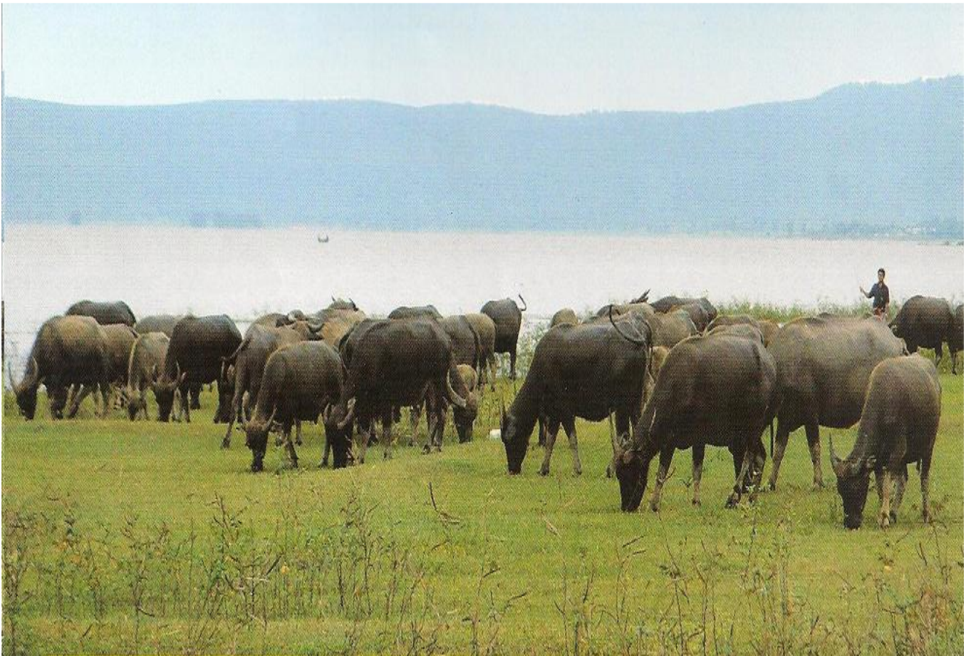
Buffaloes in Thailand