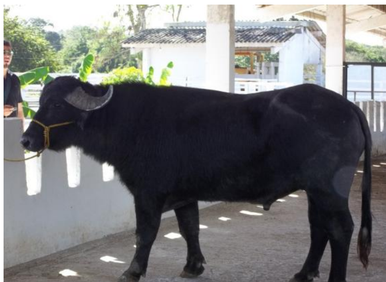
Crossbred Millennium (Mediterranean Italian breed) x Buffalypso. Livestock Company “El Cangre”.