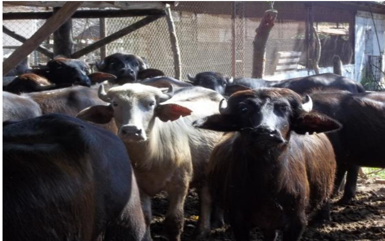
Buffalypso herd with albino animal. Livestock Company “El Cangre”, Cuba (Borghese photo, 2011)